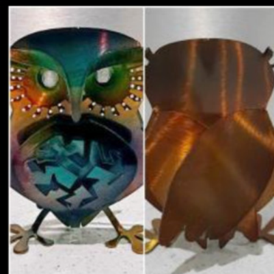
Kowook (Boobook Owl)