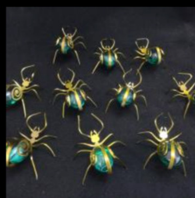
Small Green ants (8cm)