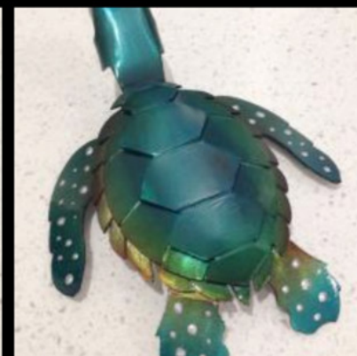
Waru (Green Sea Turtle)