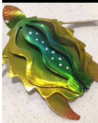
ru (Leatherback Sea Turtle)