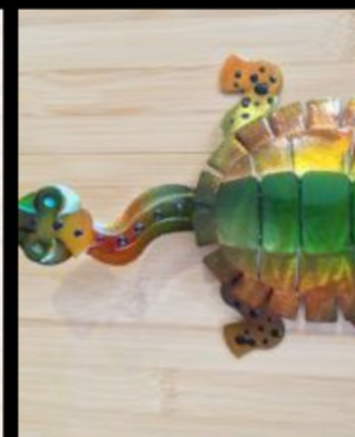
Bungaroo (Long Neck Turtle)