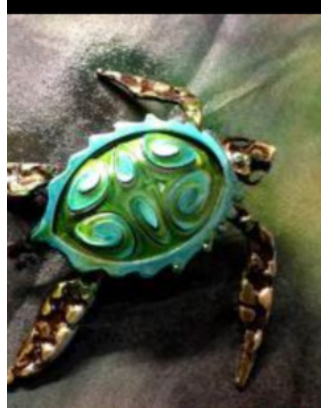
Baby Waru (Sea Turtle)