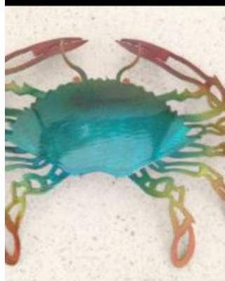
Muroot (Mud Crab)