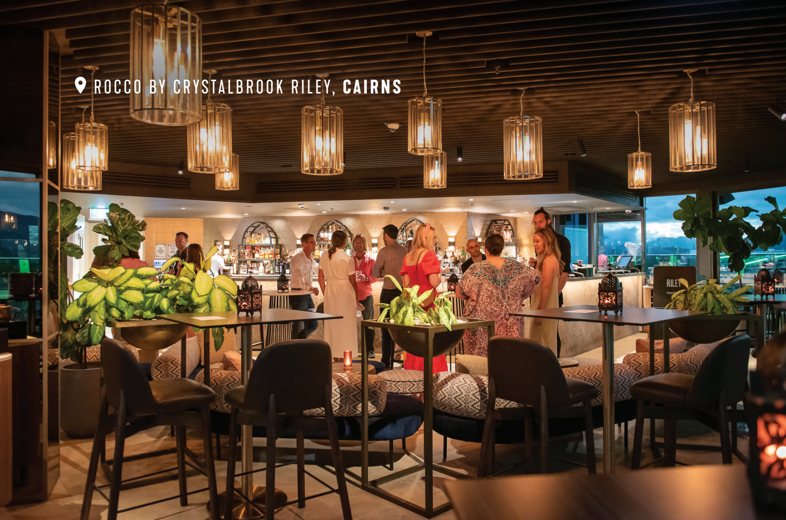
📍 ROCCO BY CRYSTALBROOK RILEY, CAIRNS