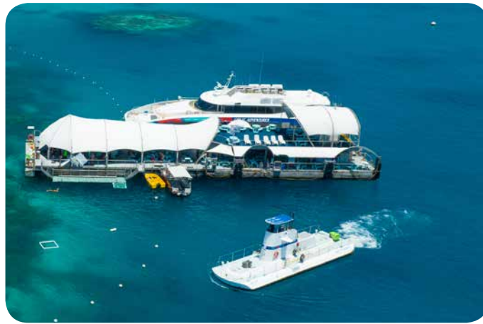
MOORE REEF 45m Reef Activity Platform